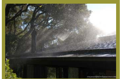
Photo 1. Roof mounted sprinkler.

Given the potential issues regarding performance, it's recommended that use be a supplement to, and not a replacement for, already proven mitigation strategies, such as the reduction of potential fuels throughout the home ignition zones, along with removal of roof and gutter debris, and use of noncombustible and fire/ember-ignition resistant building materials and installation design details.