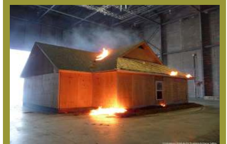
Photo 2. In order to be effective, external sprinklers must be able to wet all areas where ignition can occur, or be sufficiently effective in quenching embers that approach the home so they won't have enough energy to ignite combustible items.